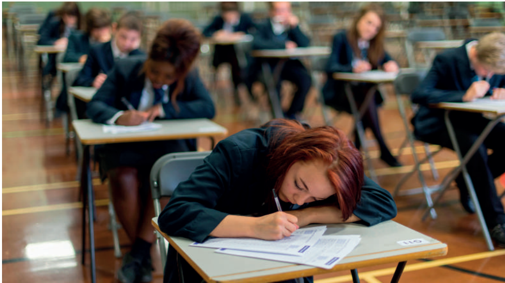
Students sitting a GCSE exam.

Some schools offer GCSE short courses in certain subjects, such as Religious Education (RE) and Citizenship Studies. These are graded in the same way as a GCSE but are worth half a GCSE and are given less teaching time on the timetable.